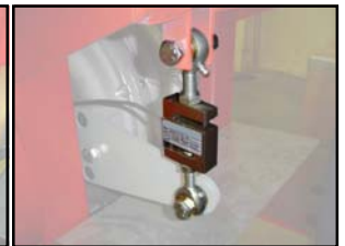
Load Cell Assembly