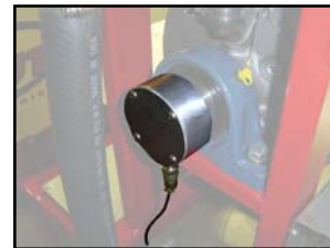
Speed Pickup Assembly

The DPM 201 provides the operator with live speed, torque and power data. The DPM 201 also retains peak observed values for all three readouts.